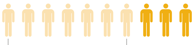
Have no exit plan

The vast majority of small business owners don't have a plan for exiting the business