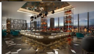
G.A. DESIGN INTERNATIONAL LIMITED

The Okura Prestige Tower's fifth-floor Orchid Bar will be a sophisticated, contemporary reinterpretation of the original Orchid Bar's tradition and prestige. On the top floor, Starlight guests will enjoy magnificent views of the Tokyo nightscape from three vantage points—The Bar, The Lounge and The Chef's Place.