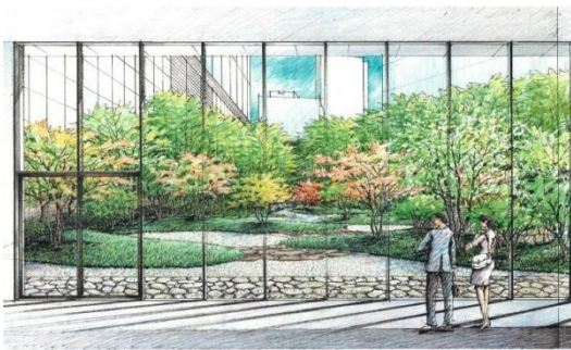
TAISEI DESIGN Planners Architects & Engineers

Covering approximately half (13,000 square meters) of The Okura Tokyo's property, the Okura Garden will be an expansive "urban oasis" that captures the beauty of each season and incorporates the Japanese-garden karesansui tradition of using rocks and raked sand to express water themes.