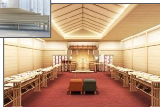
KANKO KIKAKU SEKKEISHA

The Okura Prestige Tower's wedding facilities will include the top-floor Sky Chapel for stunning views of Tokyo, the classically elegant Grand Chapel, and a hall for traditional Japanese Shinto weddings.