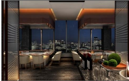
KANKO KIKAKU SEKKEISHA

Dining choices in The Okura Heritage Wing will include Yamazato, where guests will enjoy Japanese cuisine ranging from breakfast to kaiseki multi-course meals with views across a lovely Japanese garden, the Chosho-an tea ceremony room, and Nouvelle Epoque, which will serve culinary creations based on French cuisine accented with Japanese seasonal delicacies.