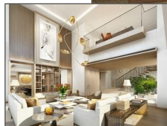
G.A. DESIGN INTERNATIONAL LIMITED

The spacious guest rooms in The Okura Heritage Wing will offer a generous floor area of 60m 2 with broad 8m widths. All rooms will feature the distinctive flavor of Japanese interior design and come equipped with steam saunas and spa baths for enhanced relaxation.