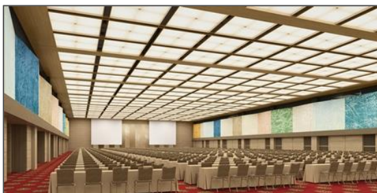
TAISEI DESIGN Planners Architects & Engineers

The Okura Prestige Tower will boast no fewer than 19 function rooms spanning a wide range of capacities. The Heian Room will accommodate up to 2,000 people, making this one of Tokyo's largest ballrooms. Motifs from the Collection of Ancient and Modern Japanese Poems, a national treasure, will decorate the walls. The room will also boast a first-class audio and visual system.