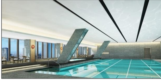
TAISEI DESIGN Planners Architects & Engineers

The Okura Prestige Tower will offer access to the Okura Fitness & Spa for exercise and relaxation against the backdrop of panoramic views of Tokyo on the 26 th and 27 th floors.