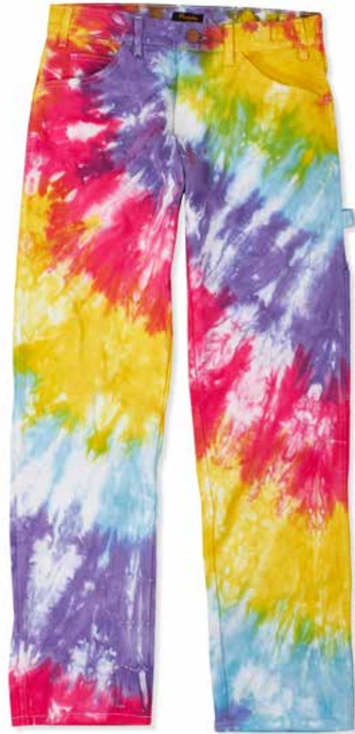
SLIM CARPENTER | 19WFSTD | Tie-dye