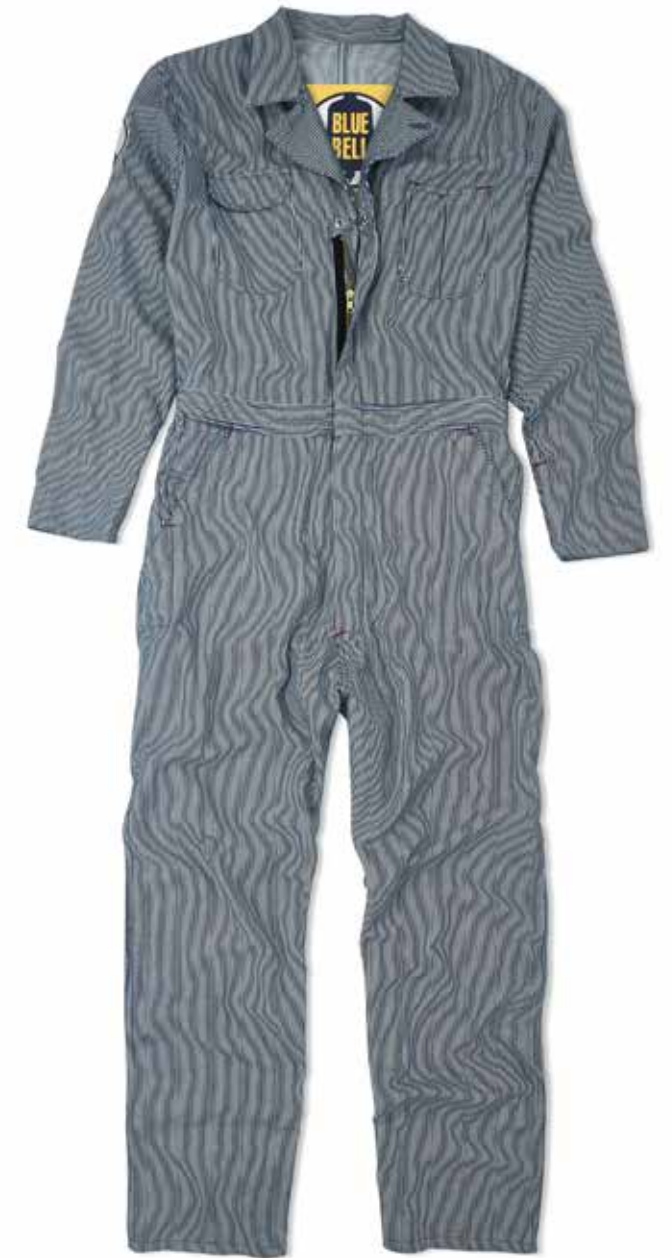
COVERALL | MCVFSHS | Indigo Hickory Stripe