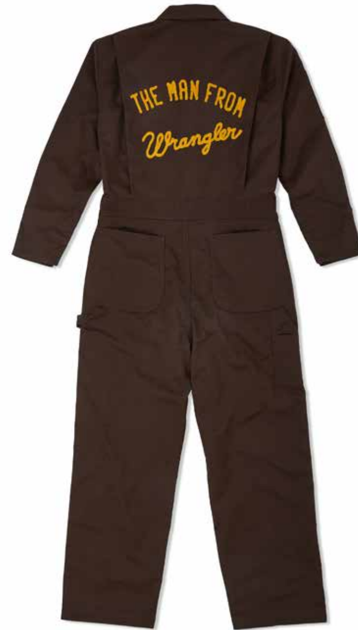
'MAN FROM WRANGLER' COVERALL | MCVFSMN | Blue Bell