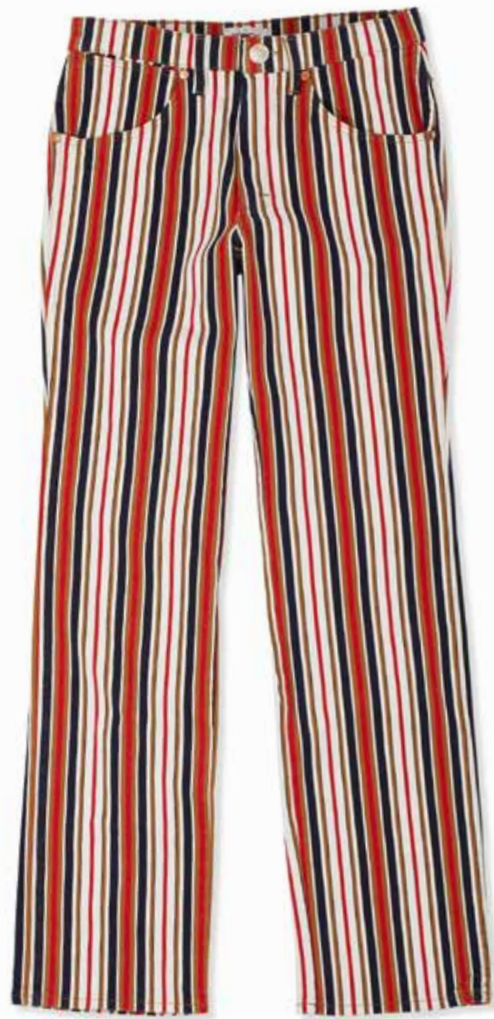
936 STRIPED PANT | 936FSST | Color Stripe