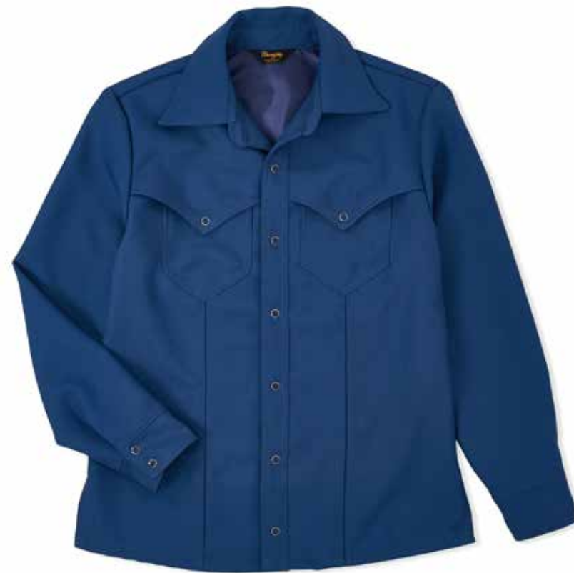
WRANCHER JACKET | 22MSFBL | Blue