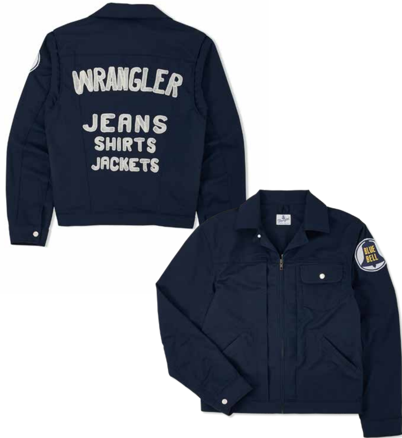
EMBROIDERED ZIP JACKET | 20WFSEM | Navy