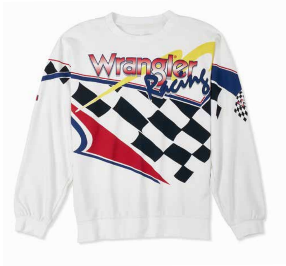
GRAPHIC DOLEMAN PULLOVER | MKLFSR6 | Checker-white