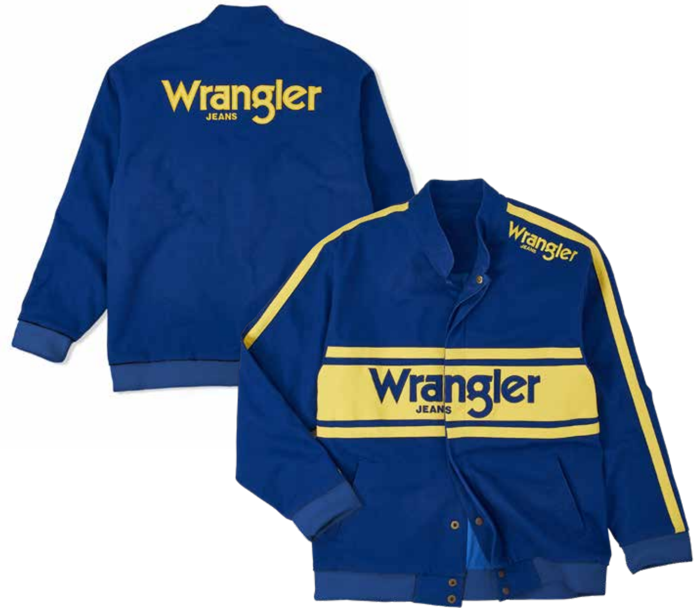
RACE JACKET | MJLFSR3 | Cobalt Blue