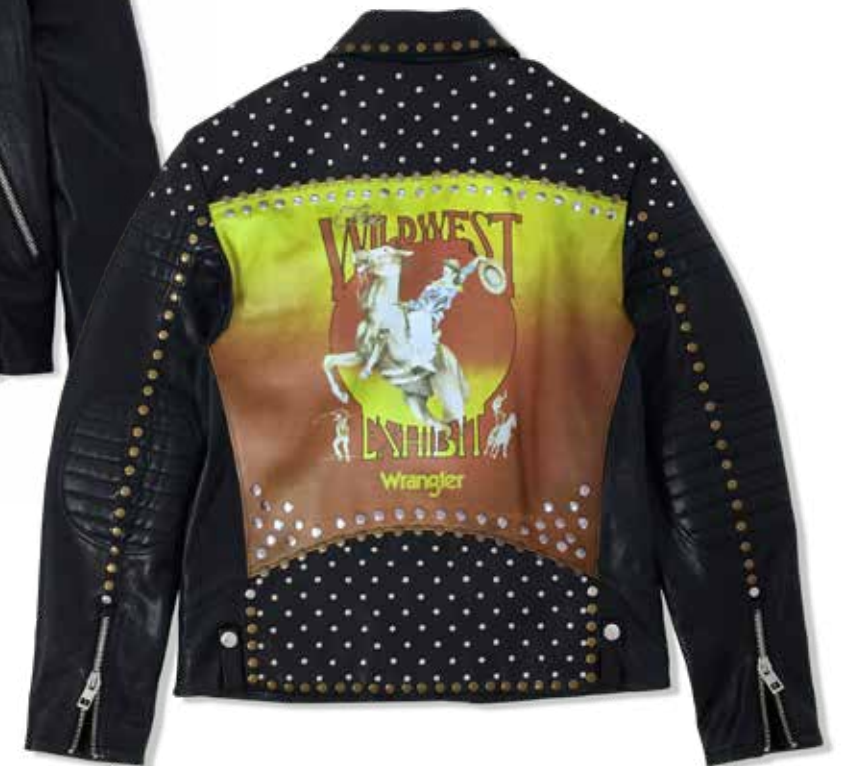
MEN'S STUDED LEATHER JACKET | 20WFSBL | Black