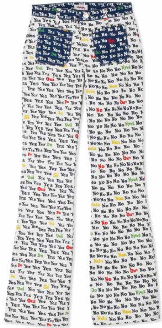
EXAGGERATED BOOT YES/NO PATTERN | WCFSBYN