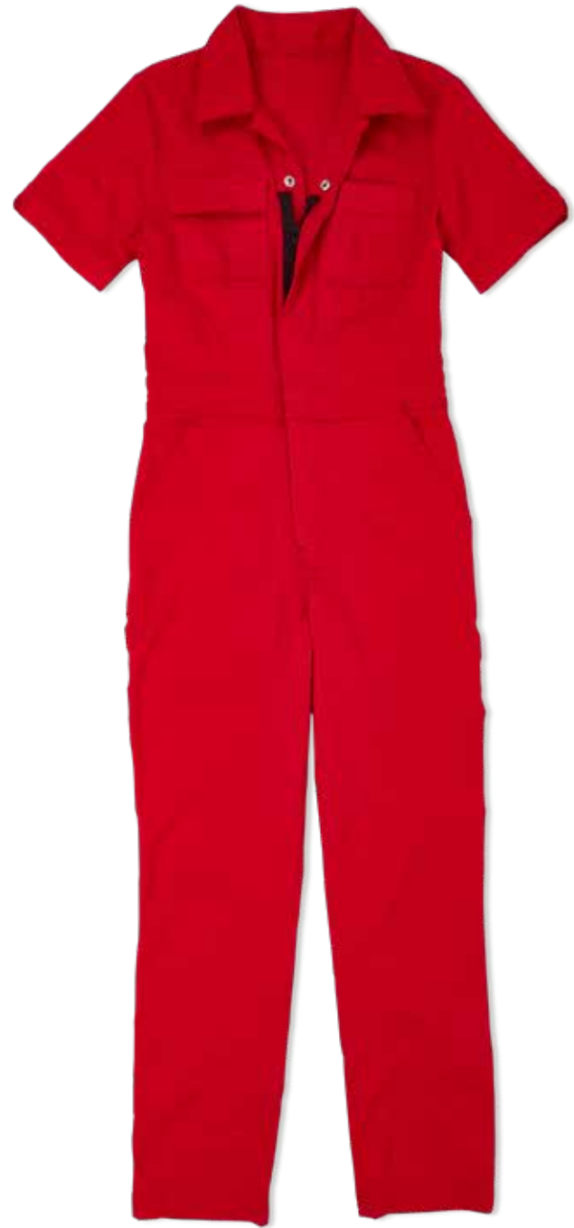
SHORT SLEEVE COVERALL | WCFSCRD | Racing Red