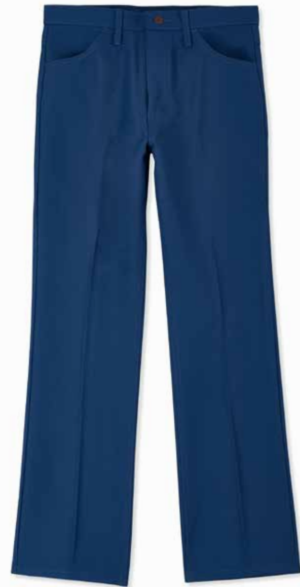
WRANCHER PANT | 82MFSBL | Blue