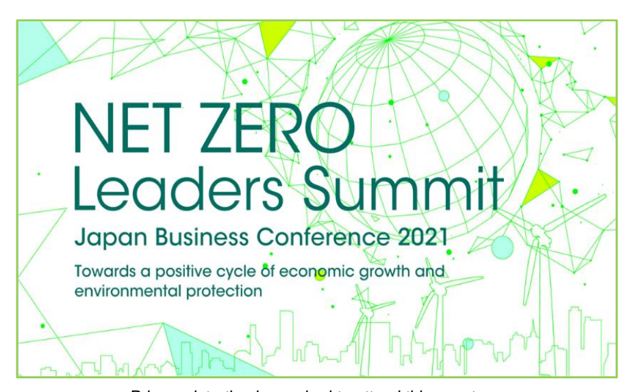
Prior registration is required to attend this event.

The main program of the event will bring together the wisdom and minds of world leaders as together we take up the challenge to achieve a positive cycle of economic growth and environmental protection. The conference will also detail and display Japan's growth vision and national initiatives toward carbon neutrality by the middle of the 21<sup>st</sup> Century.