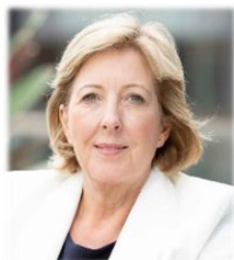
Fiona REYNOLDS CEO – PRI (Principles for Responsible Investment) (United Kingdom)