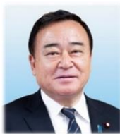
KAJIYAMA Hiroshi Minister of Economy, Trade and Industry