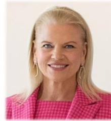
Virginia M. ROMETTY Former Chairman, President and CEO, IBM (USA)