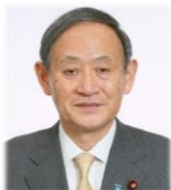
SUGA Yoshihide Prime Minister