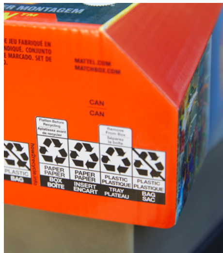
Expanded the use of the How2Recycle label , a standardized labeling system in the United States and Canada, on our packaging.