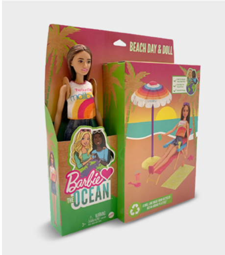
Barbie Loves the Ocean , is the first fashion doll line made from 90% plastic sourced within 50km of waterways in areas lacking formal waste collection systems, not including doll head, shoes, tablet and beach lantern accessory, in 100% plastic free packaging, made from recycled FSC-certified material.