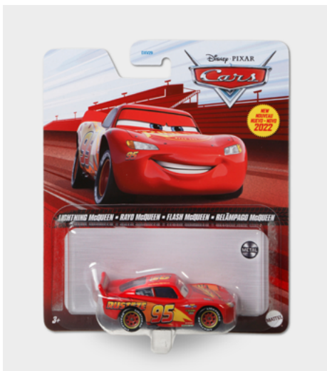
Disney Pixar Cars Die-Cast Vehicles , eliminated inner blister, reducing the amount of plastic used.