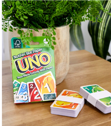
UNO Nothin' But Paper! , a 100% recyclable edition of the card game, in which the cellophane wrapping around the deck was replaced with FSC-certified paper.