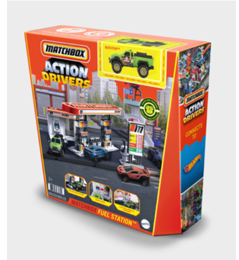
Matchbox Action Driver Fuels Station playset , removed the plastic window, featuring the vehicle, from the packaging.