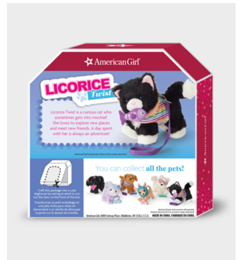
American Girl Licorice Twist plush cat , extended the play of the packaging by crafting the box into a cute cat house.