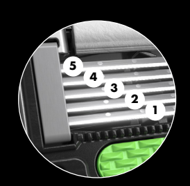
5 BLADES for great comfort and closeness