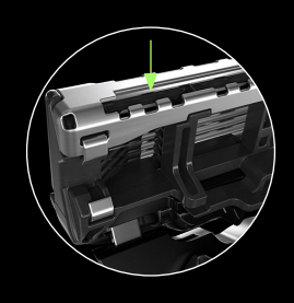
SINGLE PRECISION BLADE at the back for tricky areas