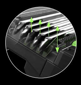
BLADES ON SPRINGS Every blade is resting on 2 springs to help them move up and down