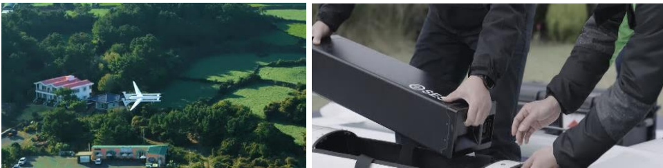
A drone equipped with Li-Metal modules in test flight

AI is far more accurate and powerful at detecting anomalies than even the best human engineers. In AI for Safety, rather than relying solely on human-developed boundary conditions, we have pre-trained our large language models (LLMs) with the cell cycling data of more than 15,000 Li-Metal cells under various mission profiles, including more than 100 actual flight hours of drones using our Li-Metal modules.