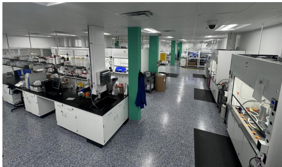
The new Electrolyte Foundry just outside our Boston HQ

Most of these molecules are completely new and not commercially available. That's why we built Electrolyte Foundry, which has been operational since April this year and is already included in our 2024 guidance. This Electrolyte Foundry employs some of the best organic synthesis chemists in the world. Now we have complete ability from molecular mapping to generative AI models for new molecules, to molecular synthesis and purification, to high-throughput electrolyte formulation screening, and to small and large cell testing. We believe no one in the battery industry has such a complete capability.