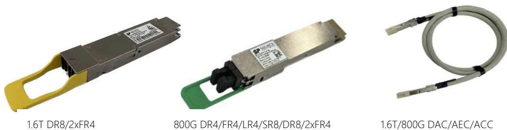
Fig.1 Source Photonics 1.6T and 800G Product Series

West Hills, CA and Frankfurt, Germany – September 23, 2024 – Source Photonics, a leading global provider of innovative and reliable technology solutions for communications and data connectivity for use in hyperscale and AI datacenters, today announce the product availability of its wide range of transceiver portfolio, including 1.6T and 800G optical modules/AOC/DAC based on single-lambda 200G PAM4 technology, the latest 800G 4×200G DR4/FR4/LR4 and 400G/800G optical modules supporting immersion liquid cooling, with live demonstration onsite at ECOC 2024 (Booth #C67) in Frankfurt, Germany. This represents a critical milestone to enable next generation 51.2T and 102.4T switch platforms for accelerated AI compute infrastructure.