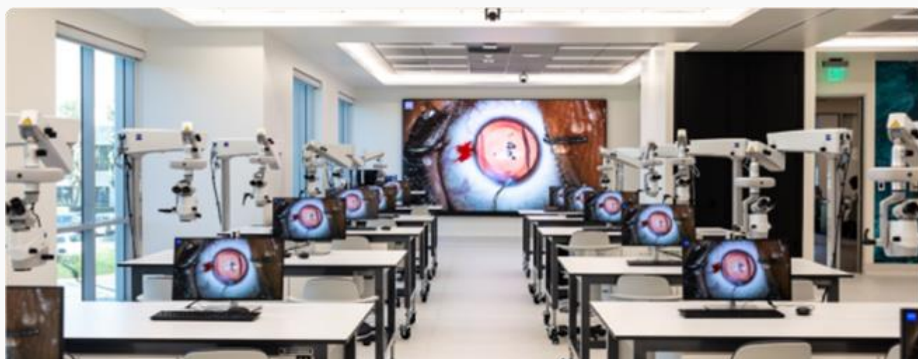
EVO ICL Experience Center